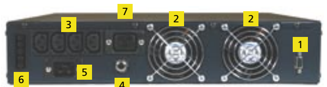
Rear panel DLPR2200/3000