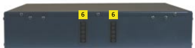
Rear panel Battery box