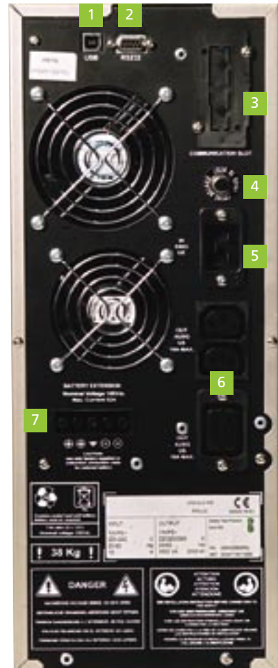
Rear panel DLD330-400