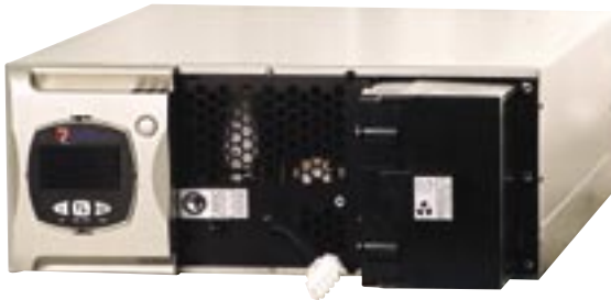
DLD330-400 hot swap batteries