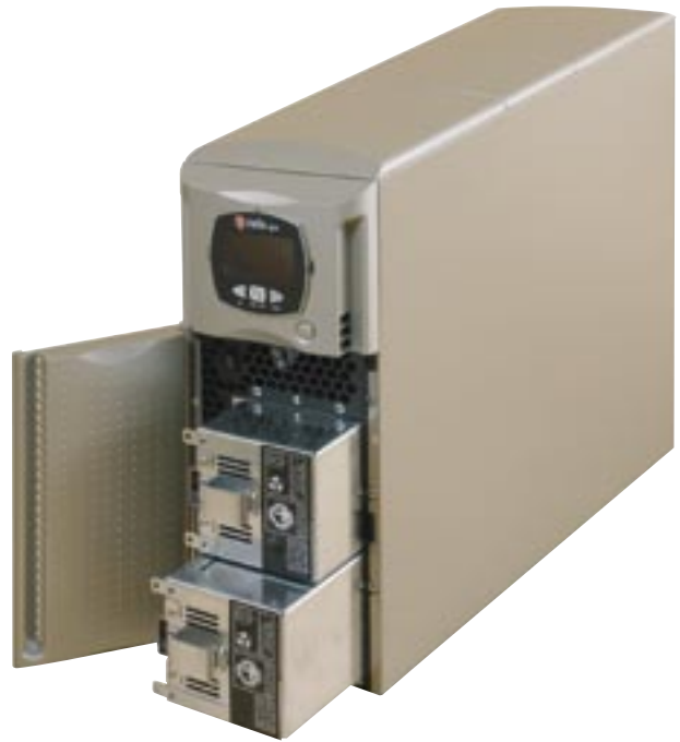
DLD500-600 hot swap batteries