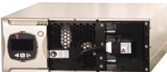
Hot Swap battery