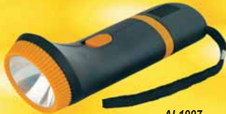
AL1997 Plastic casing, with batteries, with magnet, with hand-strap, GS/TÜV tested, CE. Colours: assorted