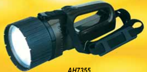
AH7355 Plastic casing, with batteries, 200 m adjustable focus, dimmer-switch, with loading station and carrier-strap, VDE - EMV tested, CE.