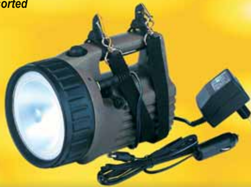
AH3810 „APOLLO“ Special-plastic casing, weatherproof, can be used as emergency light, lighting duration: 3 ½ hours (depending on temperature). With 12 V car adaptor, with shoulder carrying strap, with plug-in charger. Input: AC 230 V ~ 50 Hz. Output: DC 9 V / 300 mA. GS/TÜV tested, CE. Colour: grey/black