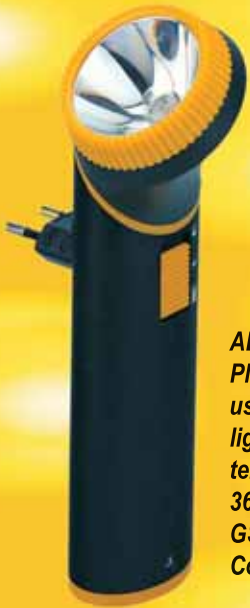
AL3325 Plastic casing, can be used as emergency light, changeable batteries, reflector swivels 360°, with magnet, GS/TÜV tested, CE. Colour: black/orange