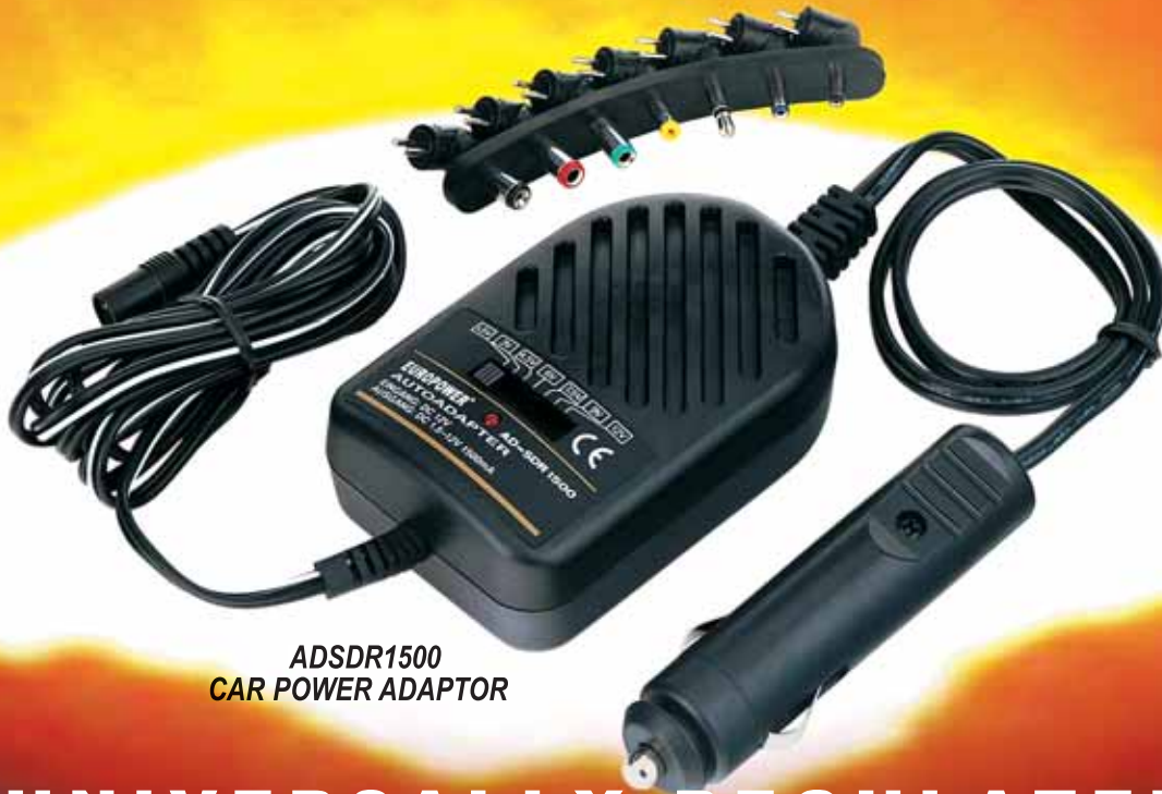
ADSDR1500 CAR POWER ADAPTOR