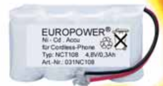
BATTERY NCT108 w. cable and universal-plug