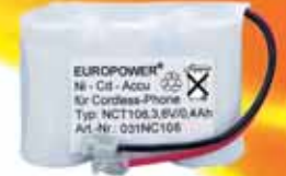
BATTERY NCT106 w. cable and universal-plug