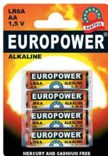
BLISTERCARD WITH BATTERIES