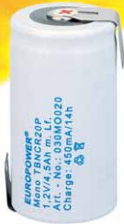
MONO w. solder tags NCR20P/D