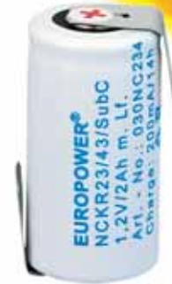
Sub C w. solder tags NCKR23/43