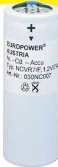
size F w. solder tags NCVR7/F